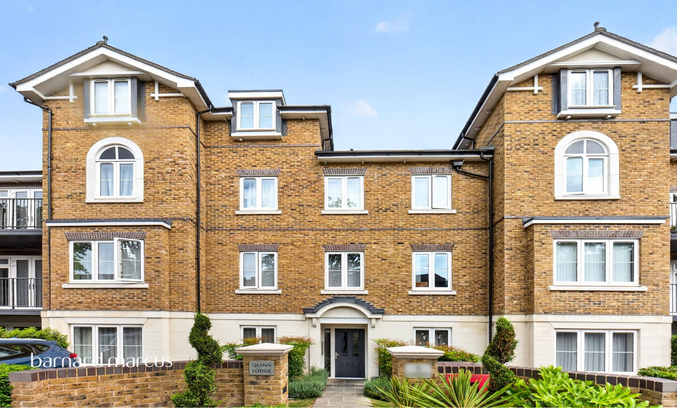
Quinn Lodge Cavendish Road, Sutton SM2 5FY