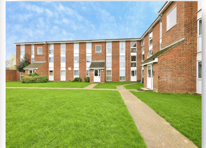
Clyfton Close, Broxbourne EN10 6NX