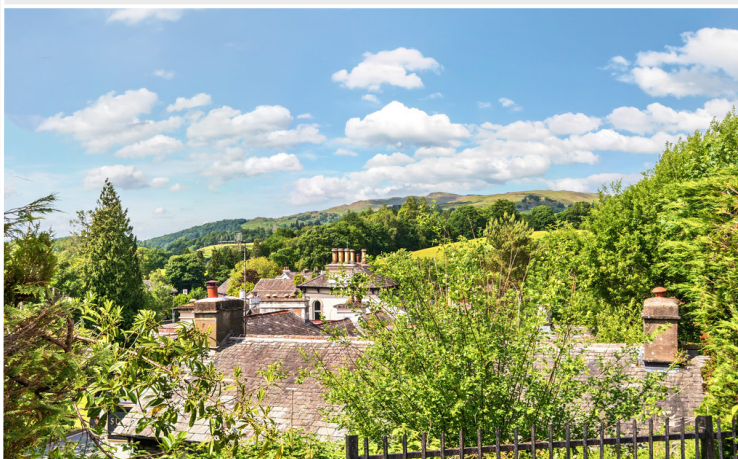
Viewing of the Fells