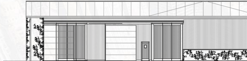
PROPOSED WEST ELEVATION INDUSTRIAL UNITS 1:100