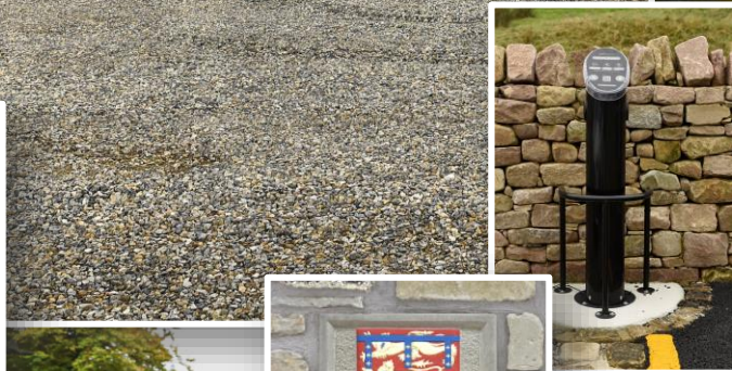
Archive LL images 17.10.2025