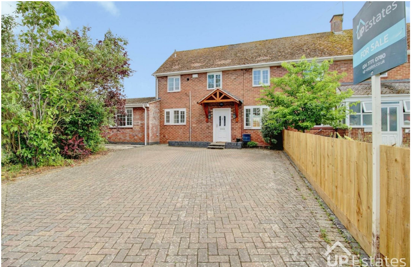
Manor Estate, Wolston, Coventry