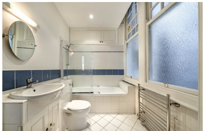
Kensington Court, W8