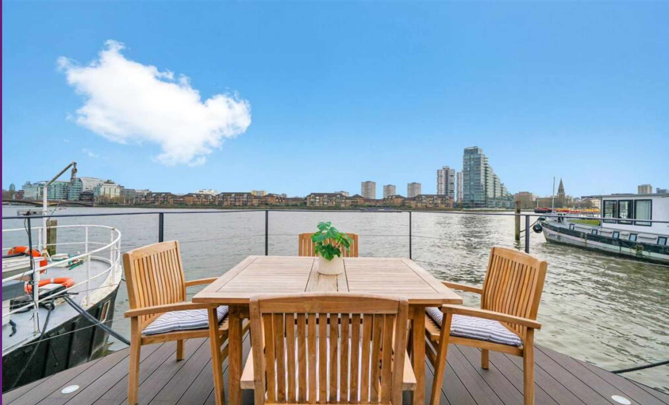
Cheyne Pier Chelsea, SW10