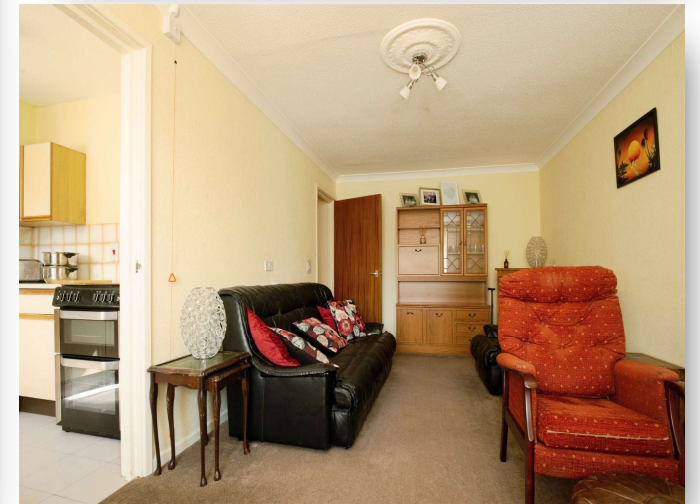
Stephenson Court Wordsworth Avenue, Roath Cardiff CF24 3FX