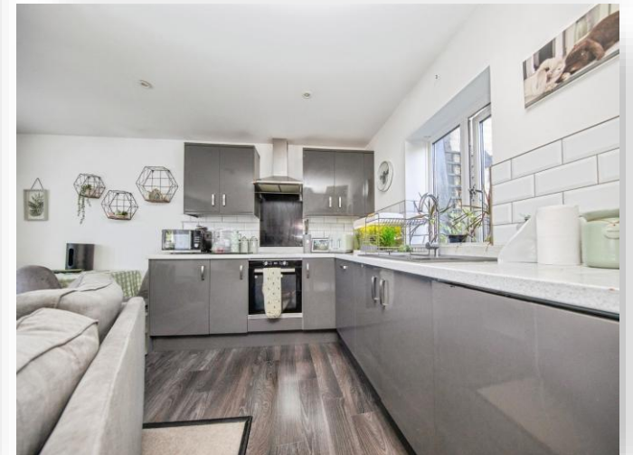
Westport Place, Foundation Street, Ipswich, IP4 1BN