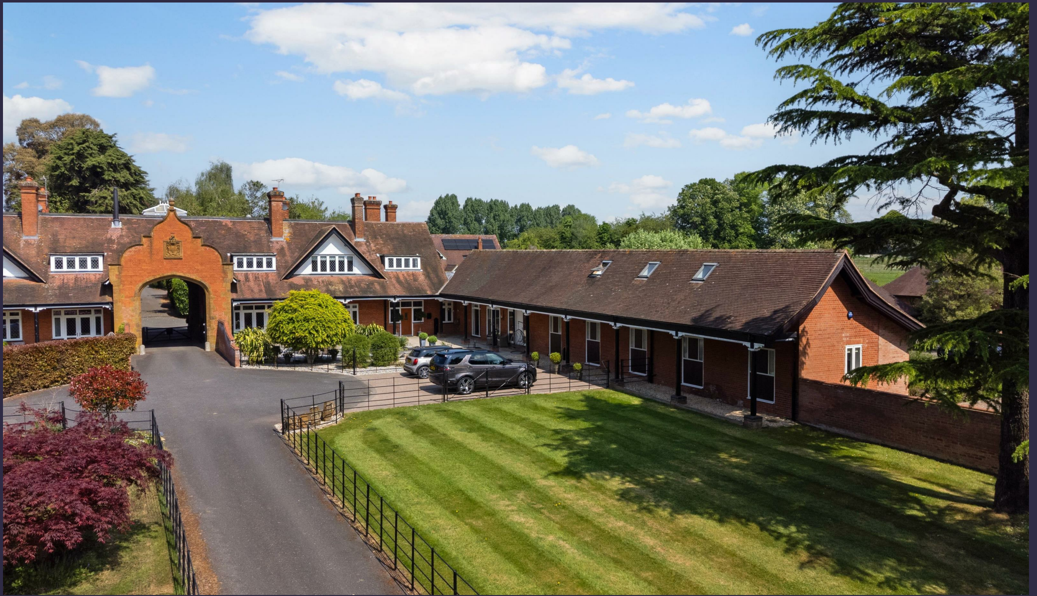
Fairlawns Moreton Paddox, Warwick, CV35 9BU