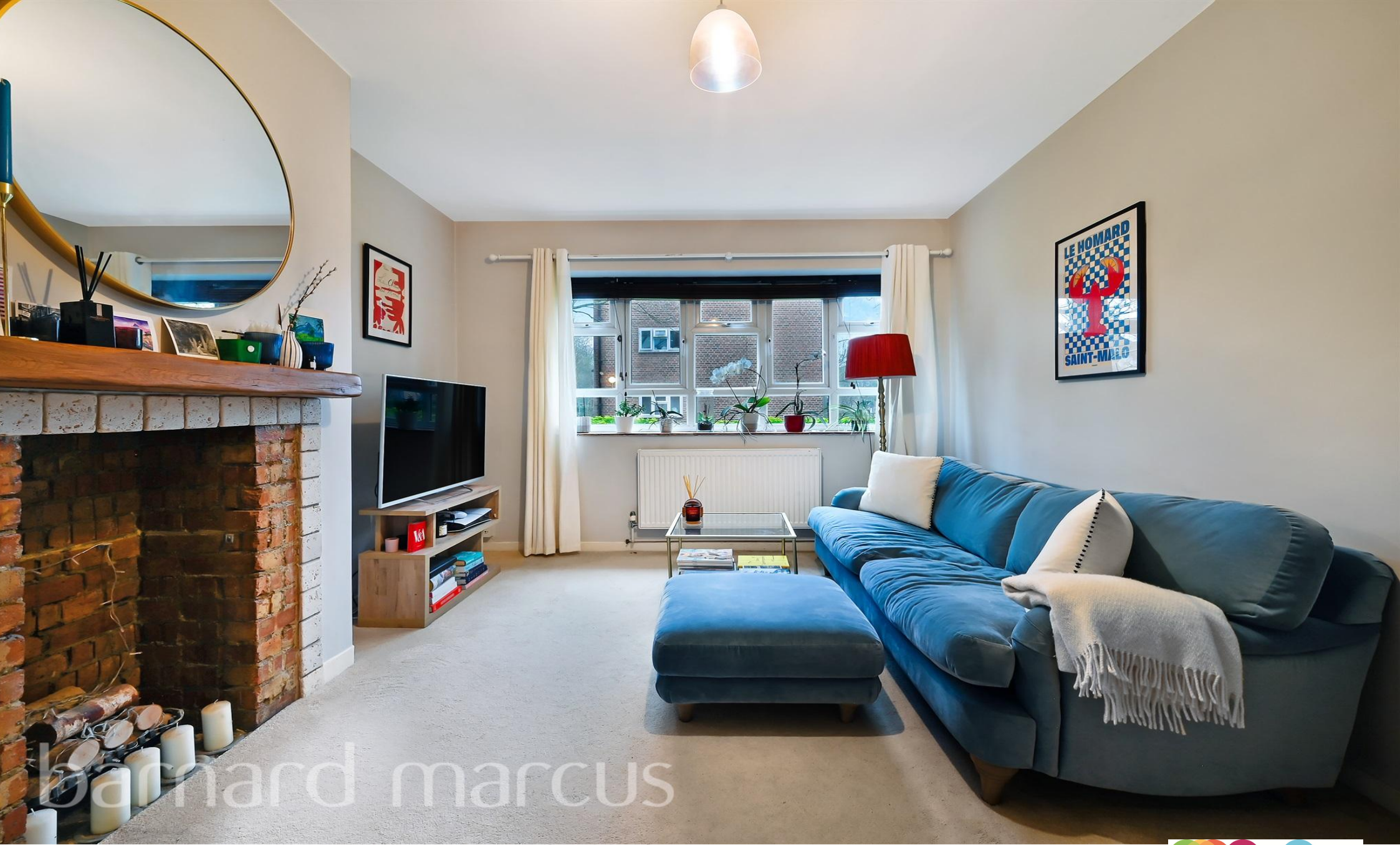
Shenstone House Aldrington Road, London SW16 1TL