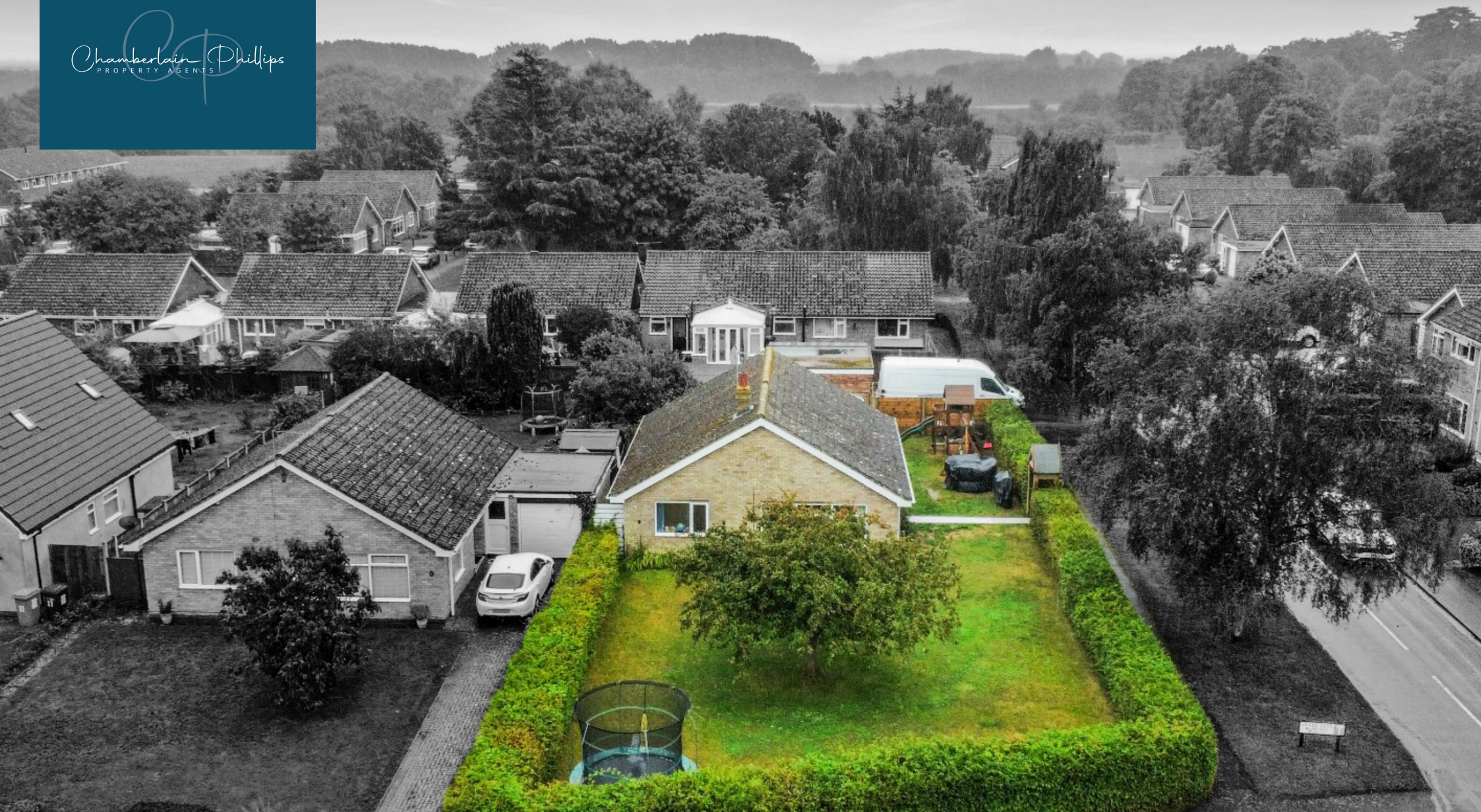
Silver Leys, Bentley £400,000