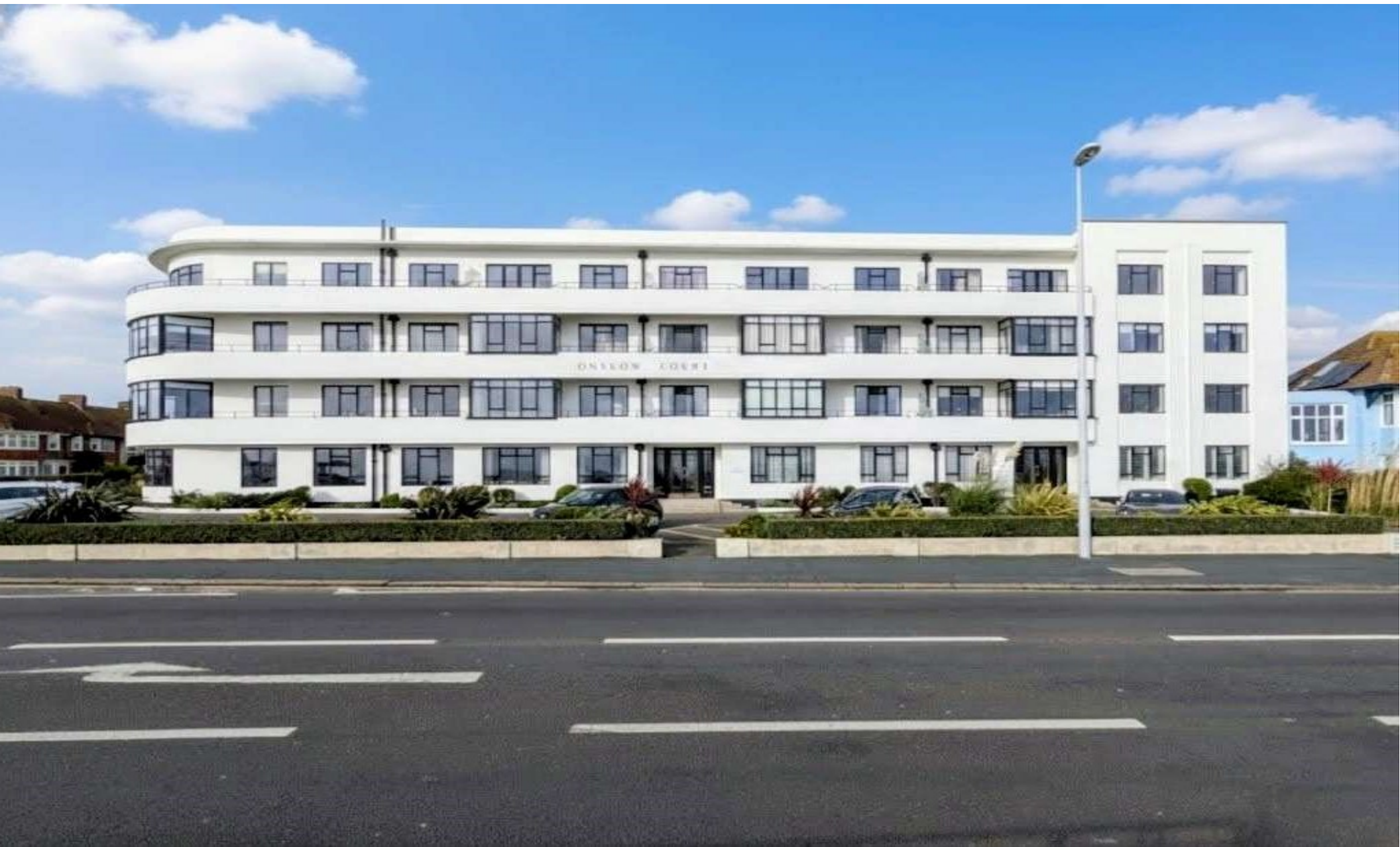
Onslow Court Brighton Road, Worthing BN11 2PL