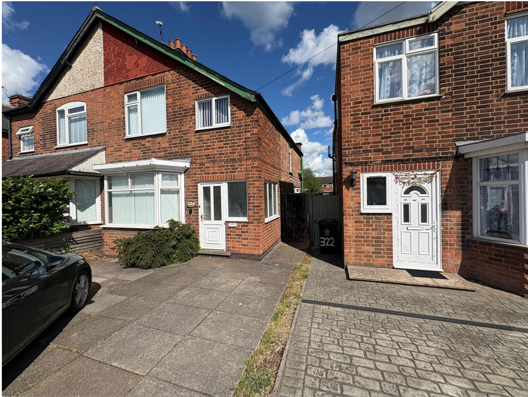
Humberstone Lane, Leicester LE4 9JP