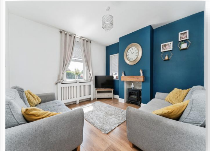
Dartford Road, March PE15 8BQ