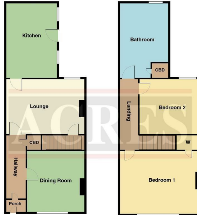
THIS PLAN IS NOT TO SCALE AND IS GIVEN TO PROVIDE A GENERAL GUIDE. IT MERELY INDICATES APPROXIMATE RELATIONSHIP OF ONE ROOM TO ANOTHER.

Every care has been taken with the preparation of these Particulars but complete accuracy cannot be guaranteed. If there is any point, which is of particular importance to you, please obtain professional confirmation; alternatively, we will be pleased to check the information for you. We have not tested any apparatus, equipment, fixture, fittings or service and so cannot verify they are in working order, fit for their purpose, or within ownership of the sellers. All Dimensions are approximate. Items shown in photographs are NOT included unless specifically mentioned in writing within the sales particulars. They may however be available by separate negotiation.