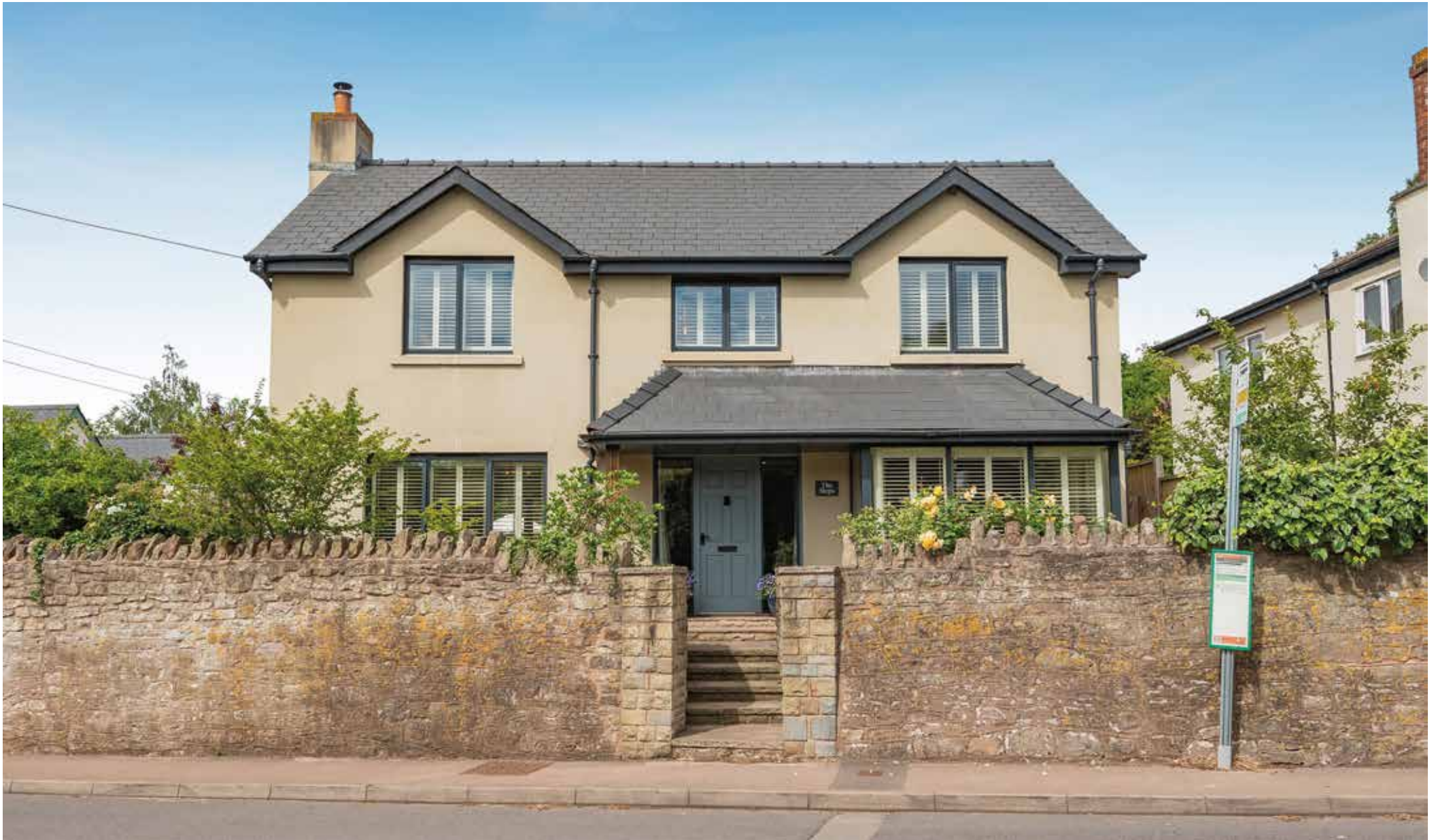
The Steps Goodrich | Ross-on-Wye | Herefordshire | HR9 6HX