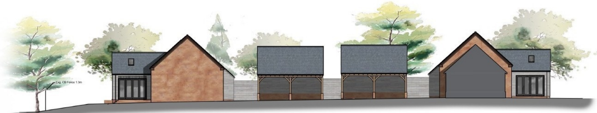
Site Section _ Line A 1:200