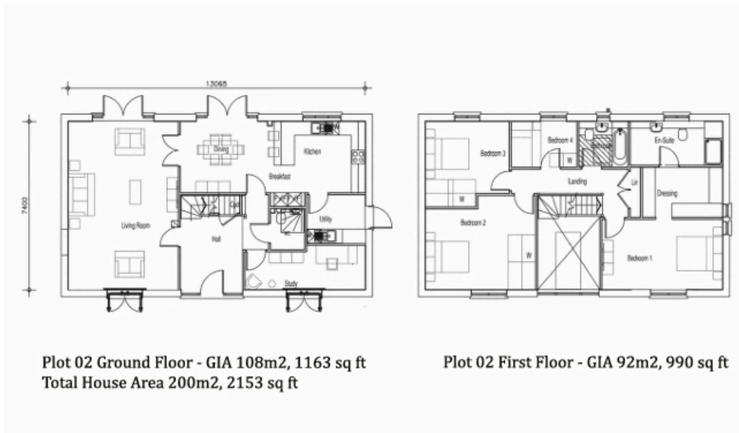
Plot 02 Ground Floor - GIA 108m 2 , 1163 sq ft Total House Area 200m 2 , 2153 sq ft