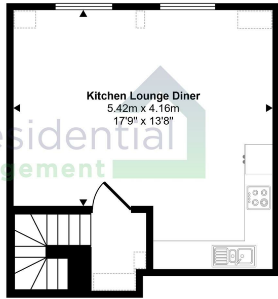
First Floor Approx 31 sq m / 336 sq ft