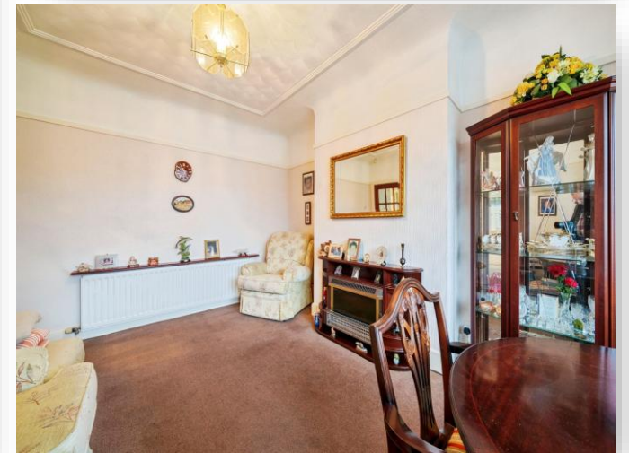
Fieldway, WALLASEY, CH45 4SG