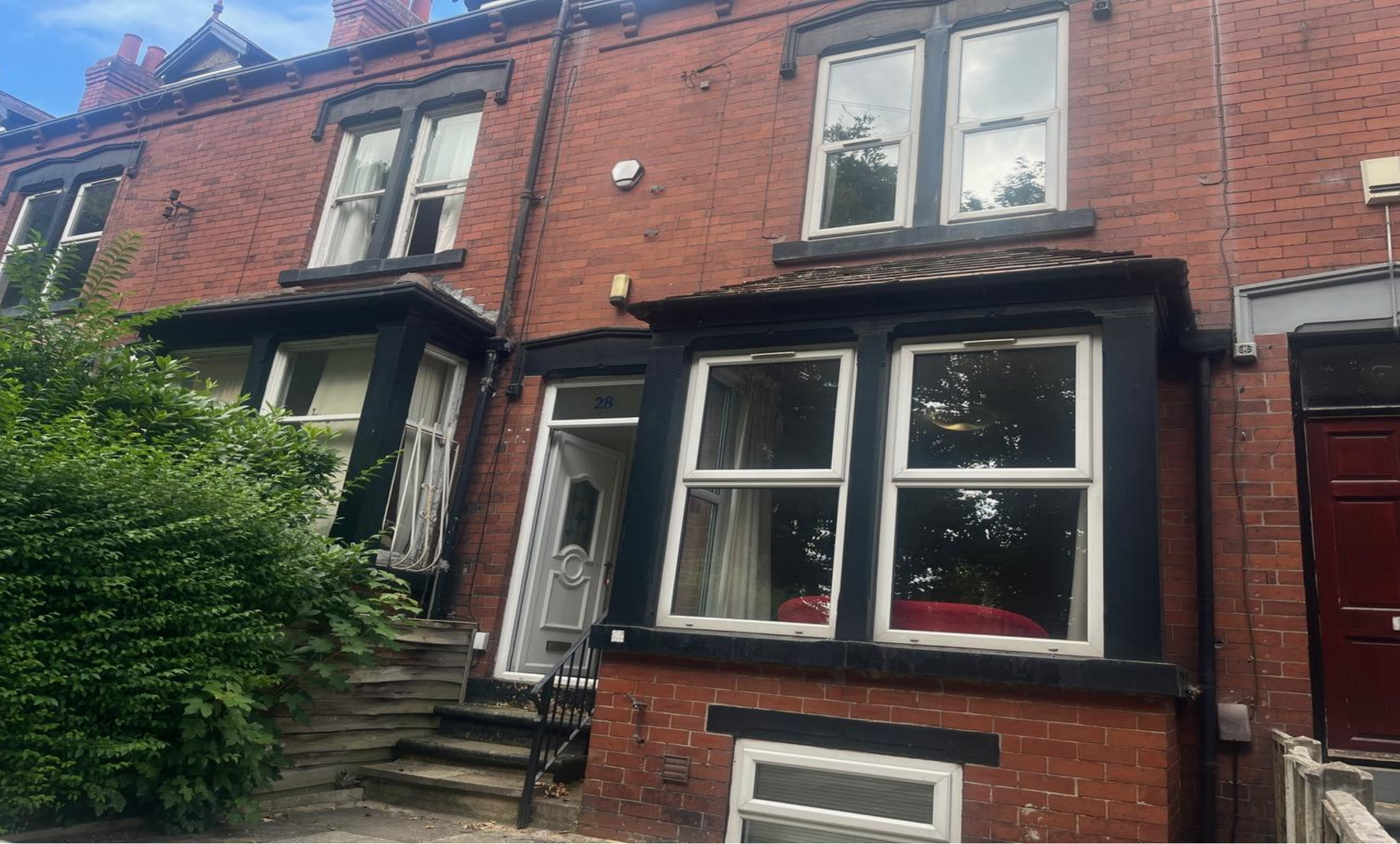
Langdale Terrace, Leeds LS6 3DY

Not for marketing purposes INTERNAL USE ONLY