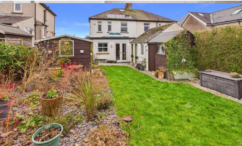
Rear Aspect and Garden