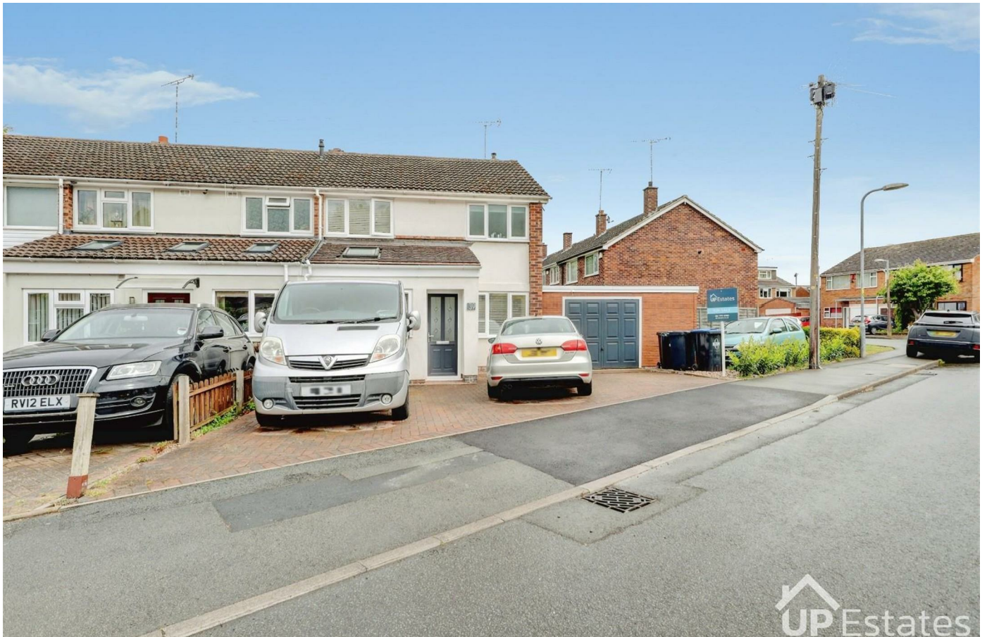
Court Leet, Binley Woods, Coventry