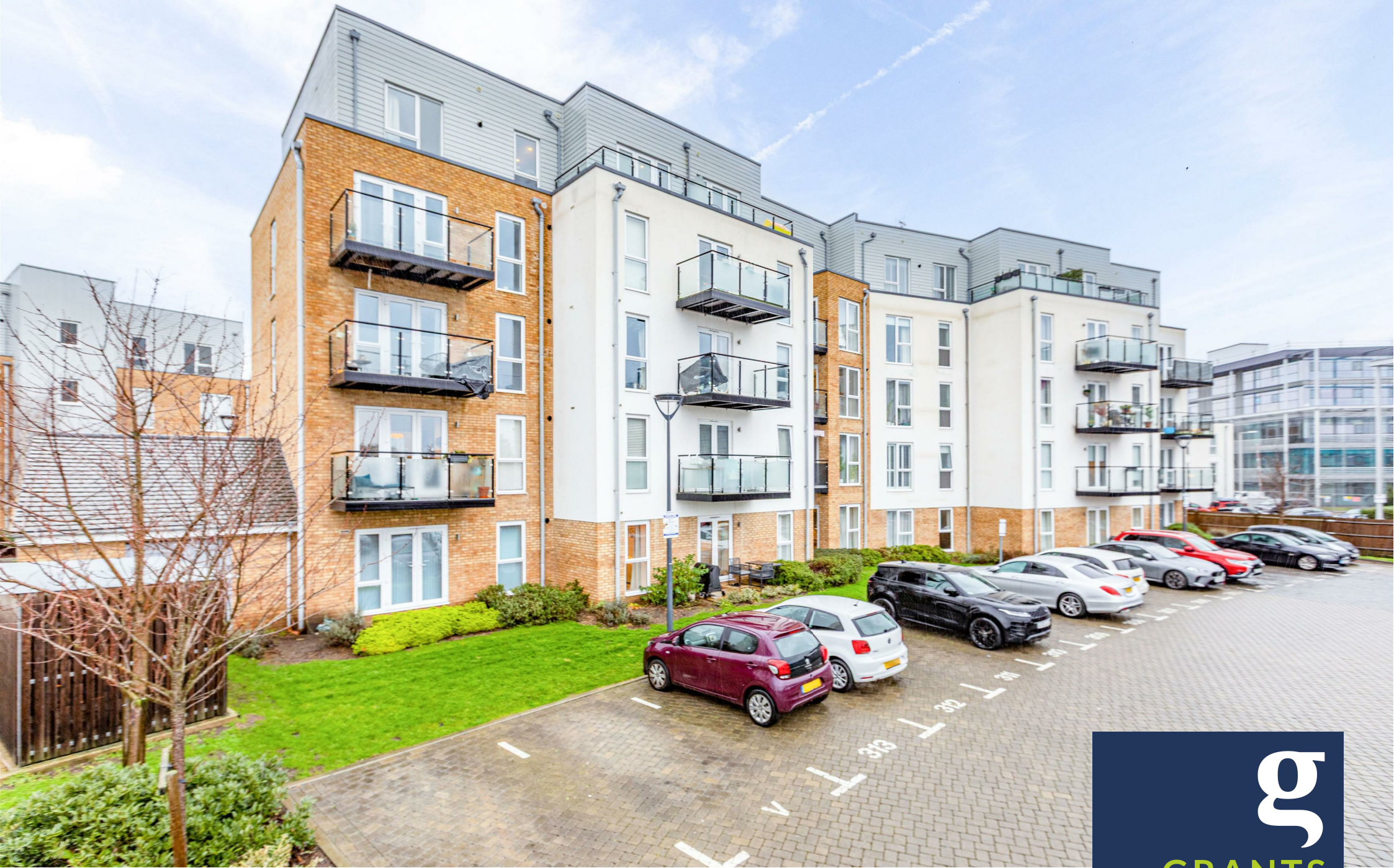
Hawker Drive, Addlestone, KT15 2FA