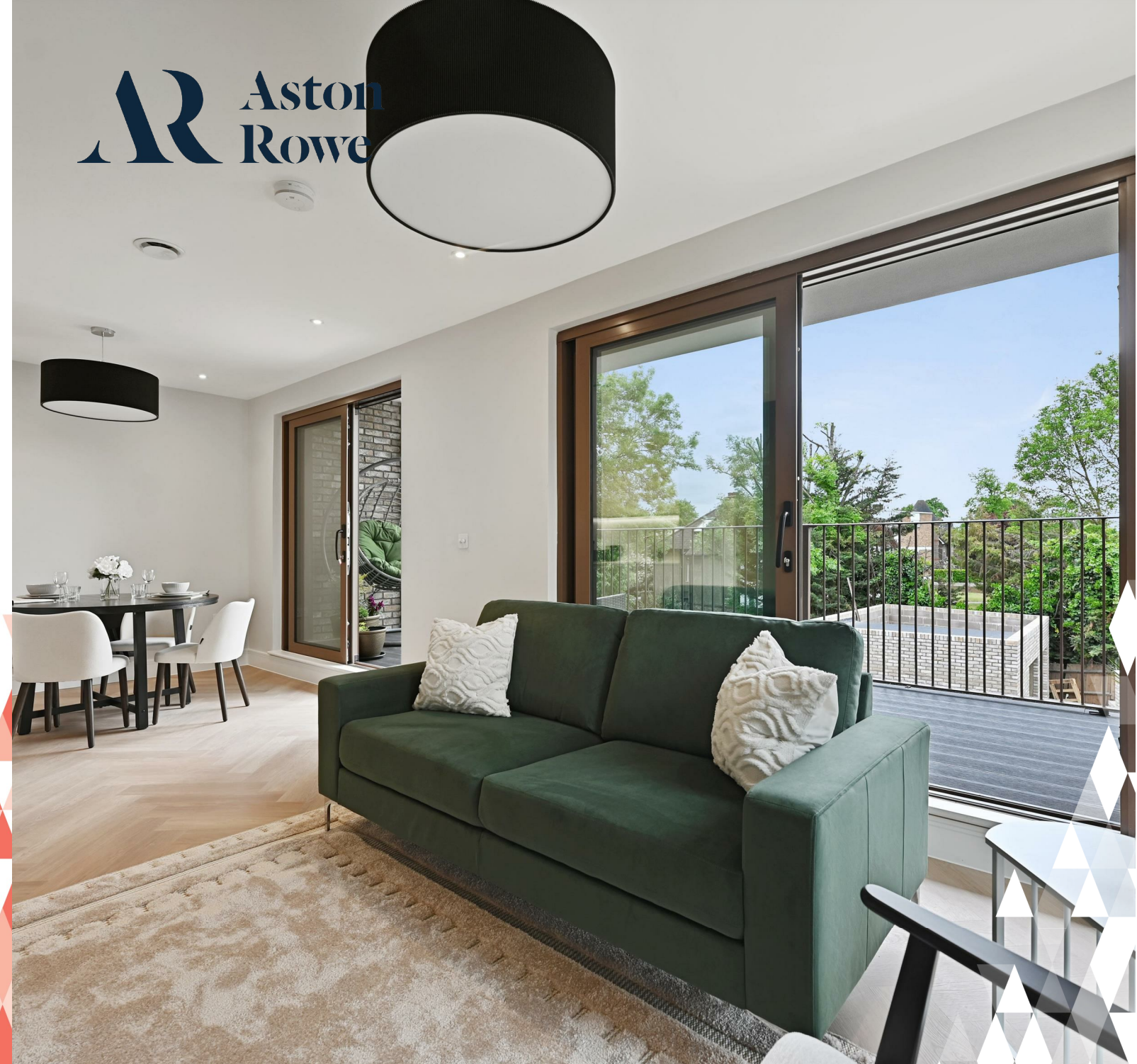
Lynton Road Approximate Gross Internal Area = 67.3 sq m / 724 sq ft