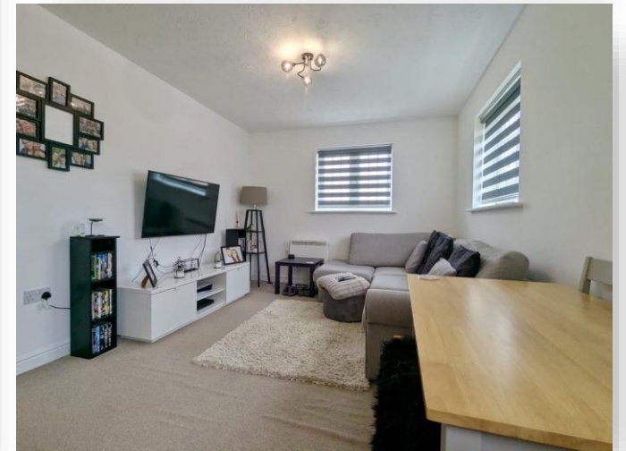
Aspen Court, Rendlesham Woodbridge IP12 2GY