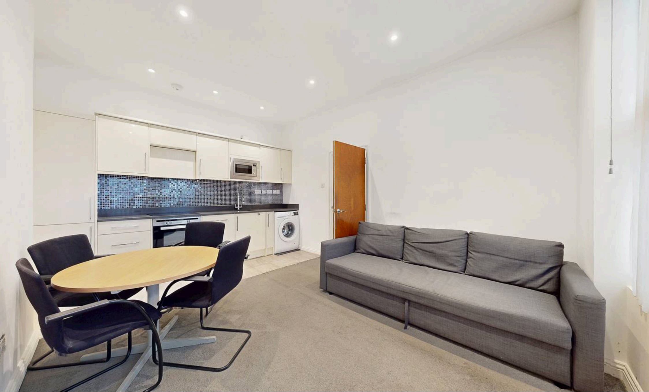
Mill Lane, London, Nw6 £2,000 pcm