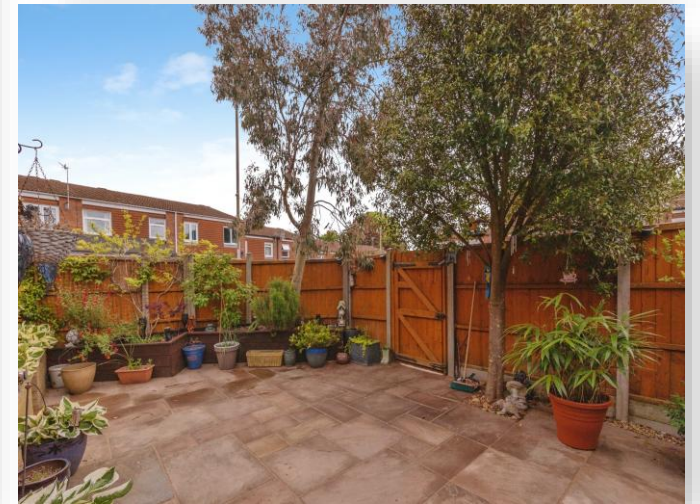
Crookhorn Lane, Waterlooville PO7 5XH