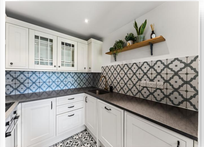
Voltaire Buildings, Garratt Lane, London SW18 4FQ