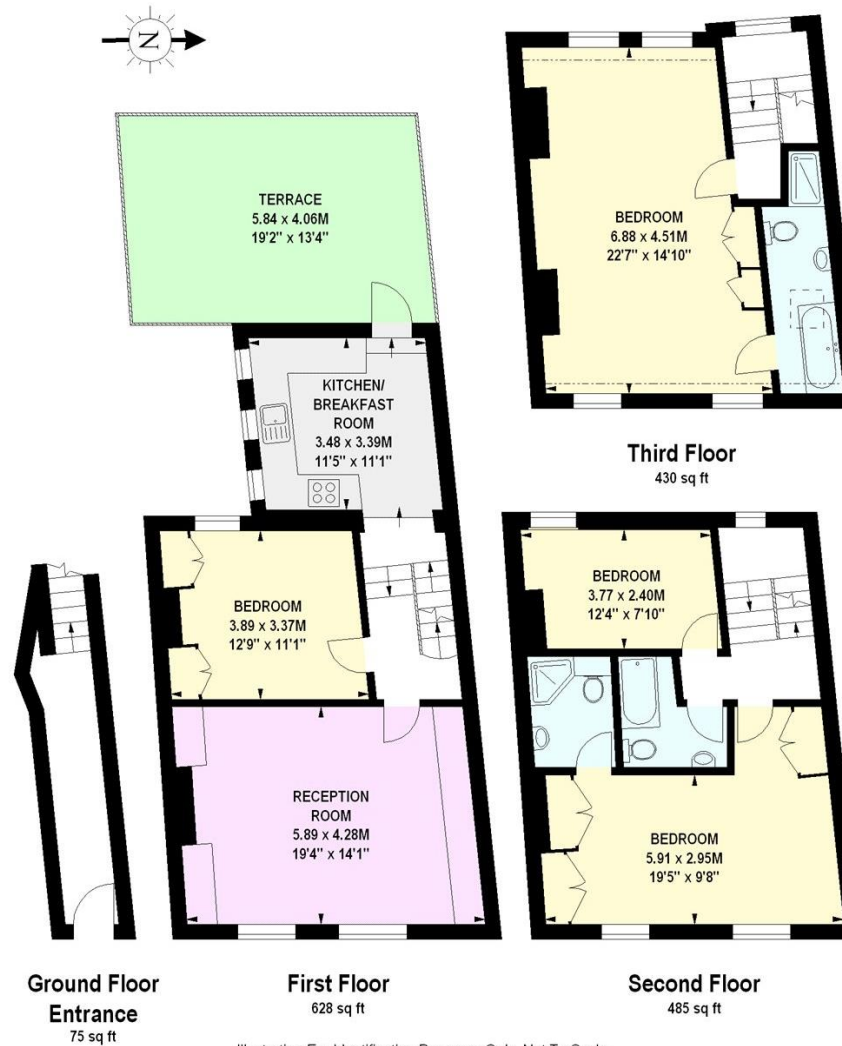
Illustration For Identification Purposes Only, Not To Scale *Floorplan Drawn According To RICS Guidelines

Chesterton UK Services Limited trading as Chestertons for themselves and for the vendor of this property whose agents they are, give notice that (i) these particulars do not constitute any part of an offer or contract, (ii) all statements contained within these particulars are made without responsibility on the part of Chestertons or the vendor, (iii) whilst made in good faith, none of the statements contained within these particulars are to be relied upon as a statement or representation of fact, (iv) any intending purchasers must satisfy themselves by inspection or otherwise as to the correctness of each of the statements contained within these particulars, (v) the vendor does not make or give either Chestertons or any person in their employment any authority to make or give representation or warranty whatsoever in relation to this property. Wide angle lenses may be used. ©Copyright Chestertons | Chesterton UK Services Limited | Registered Office 40 Connaught Street, Hyde Park, London W2 2AB Registered Company Number 05334580.