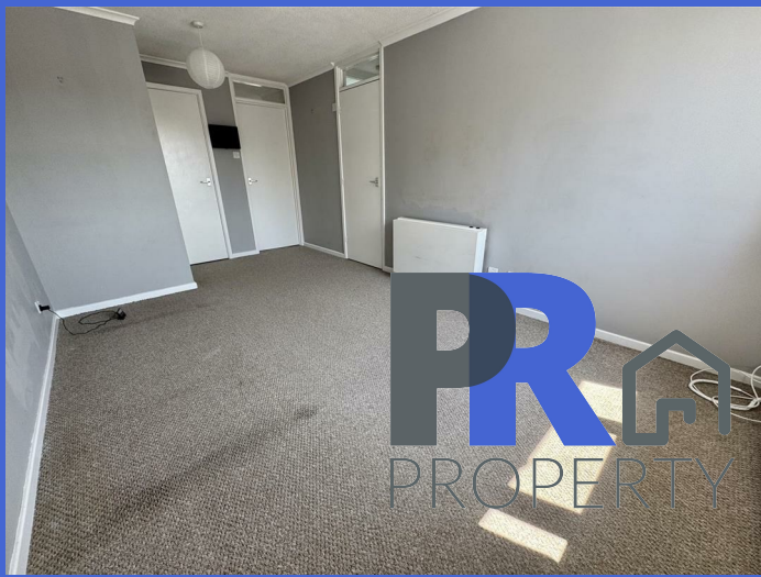
72 Penda Close, Luton, Bedfordshire, LU3 3UU £1,000 PCM