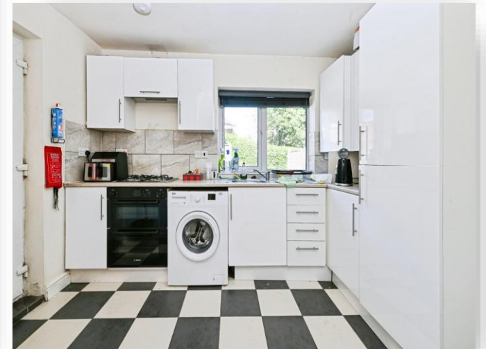
Fraser Road, Nottingham NG2 2JZ