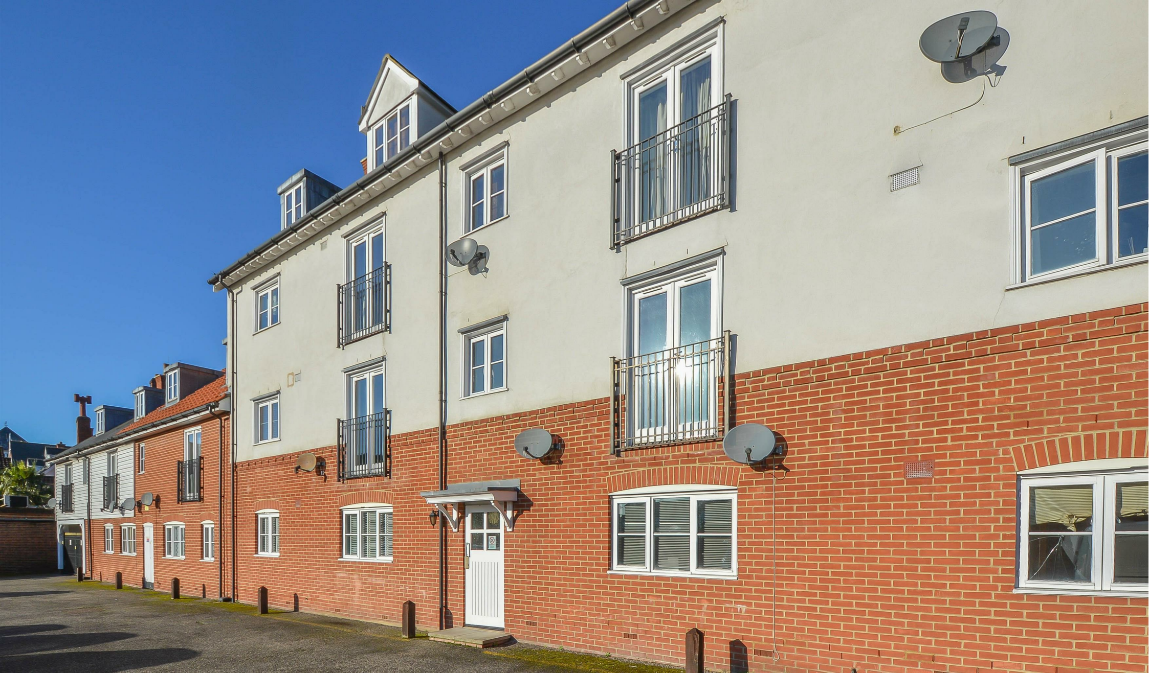
Keith Ashton Old Market Terrace, Hart Street Brentwood