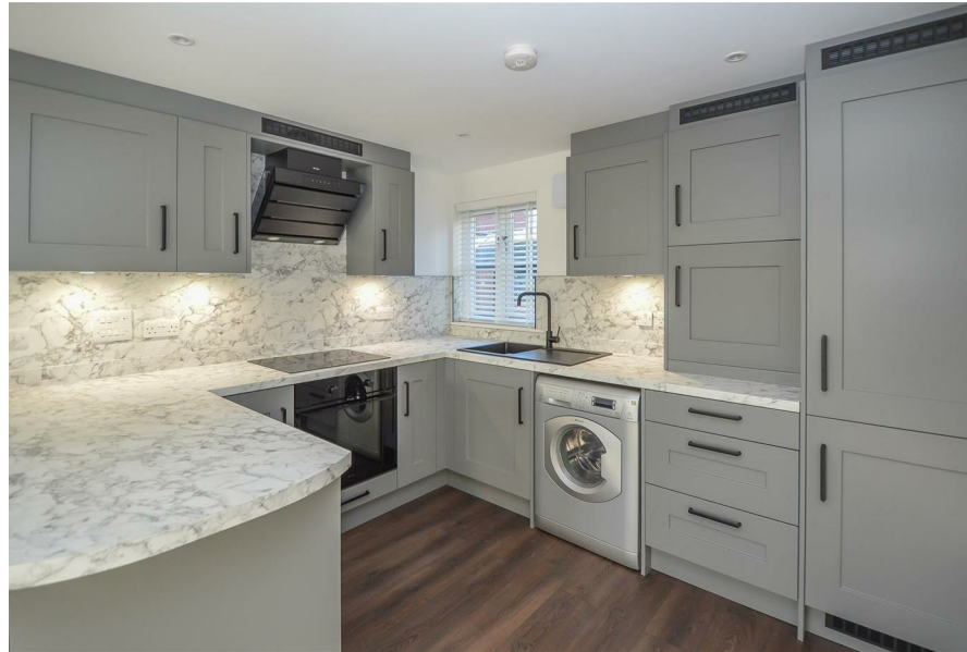
7 Old Market Terrace, Hart Street, Brentwood, CM14 4AD

TOTAL FLOOR AREA: 527 sq.ft. (48.9 sq.m.) approx. Measurements are approximate. Not to scale. Illustrative purposes only. Made with Homestyler 12/20