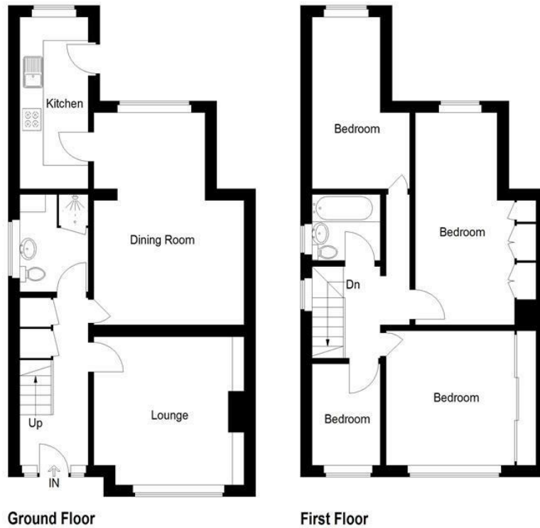
Illustration for identification purposes only, measurements are approximate, not to scale. floorplansUsketch.com © (ID1260139)

Approximate Gross Internal Area = 110.1 sq m / 1185 sq ft