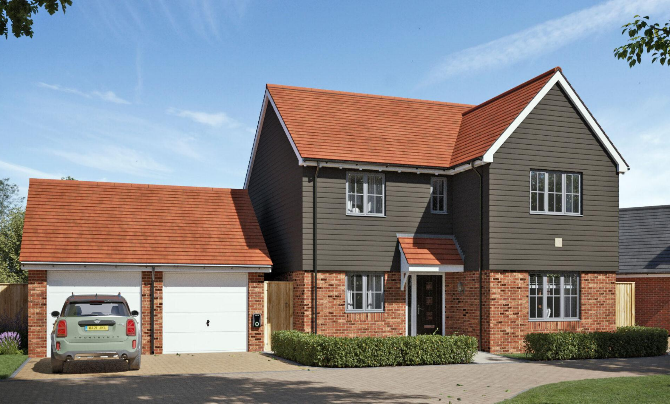
The Ashbury Brockhills Lane, New Milton BH25 5QL