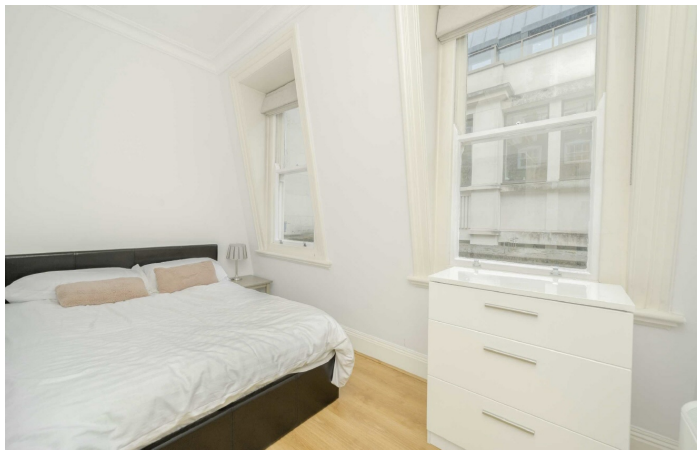
Jermyn Street, SW1Y