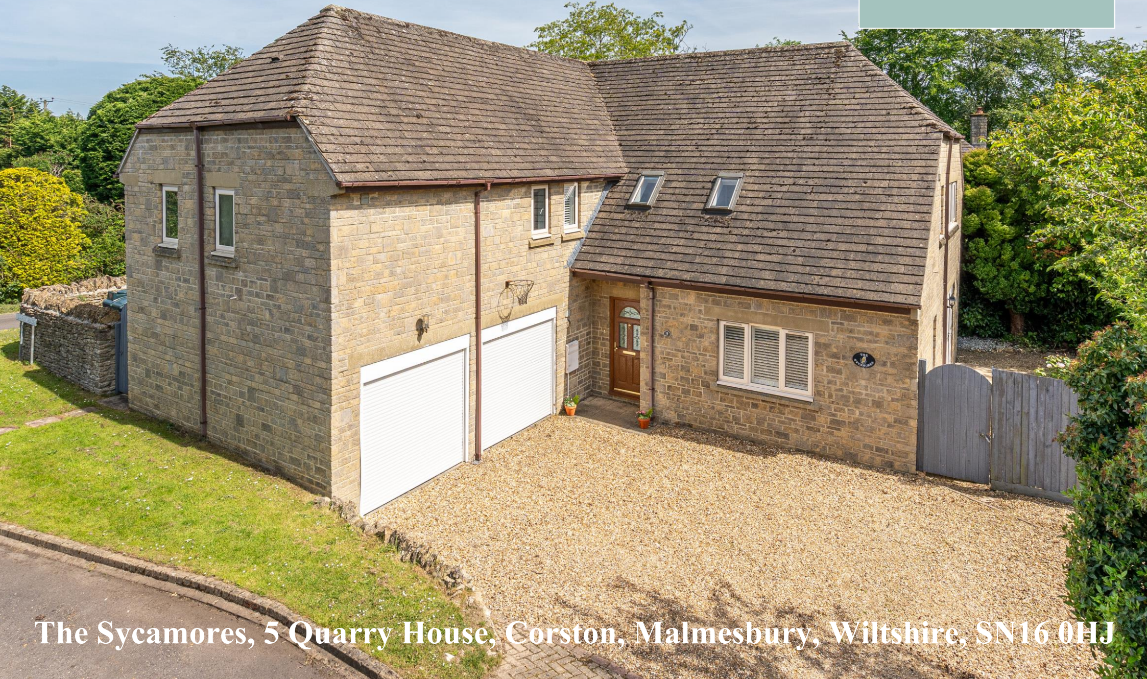
The Sycamores, 5 Quarry House, Corston, Malmesbury, Wiltshire, SN16 0HJ