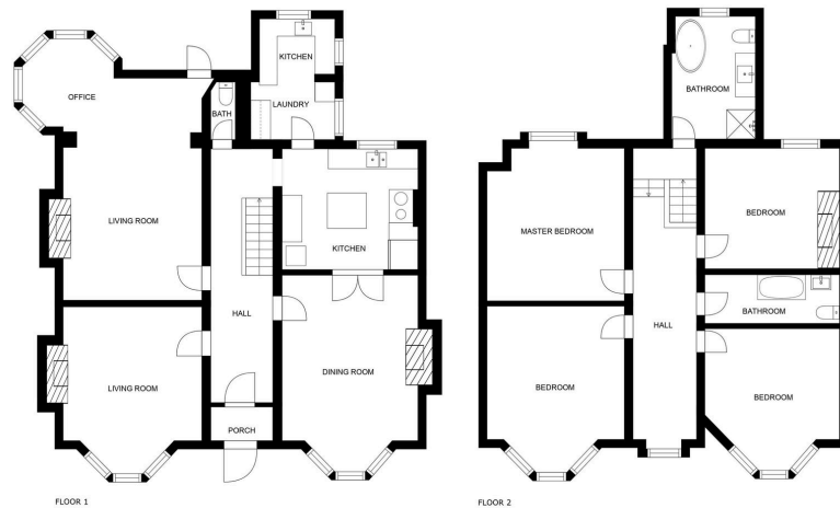
FLOOR PLAN CREATED BY CUBICASA APP. MEASUREMENTS DEEMED HIGHLY RELIABLE BUT NOT GUARANTEED.