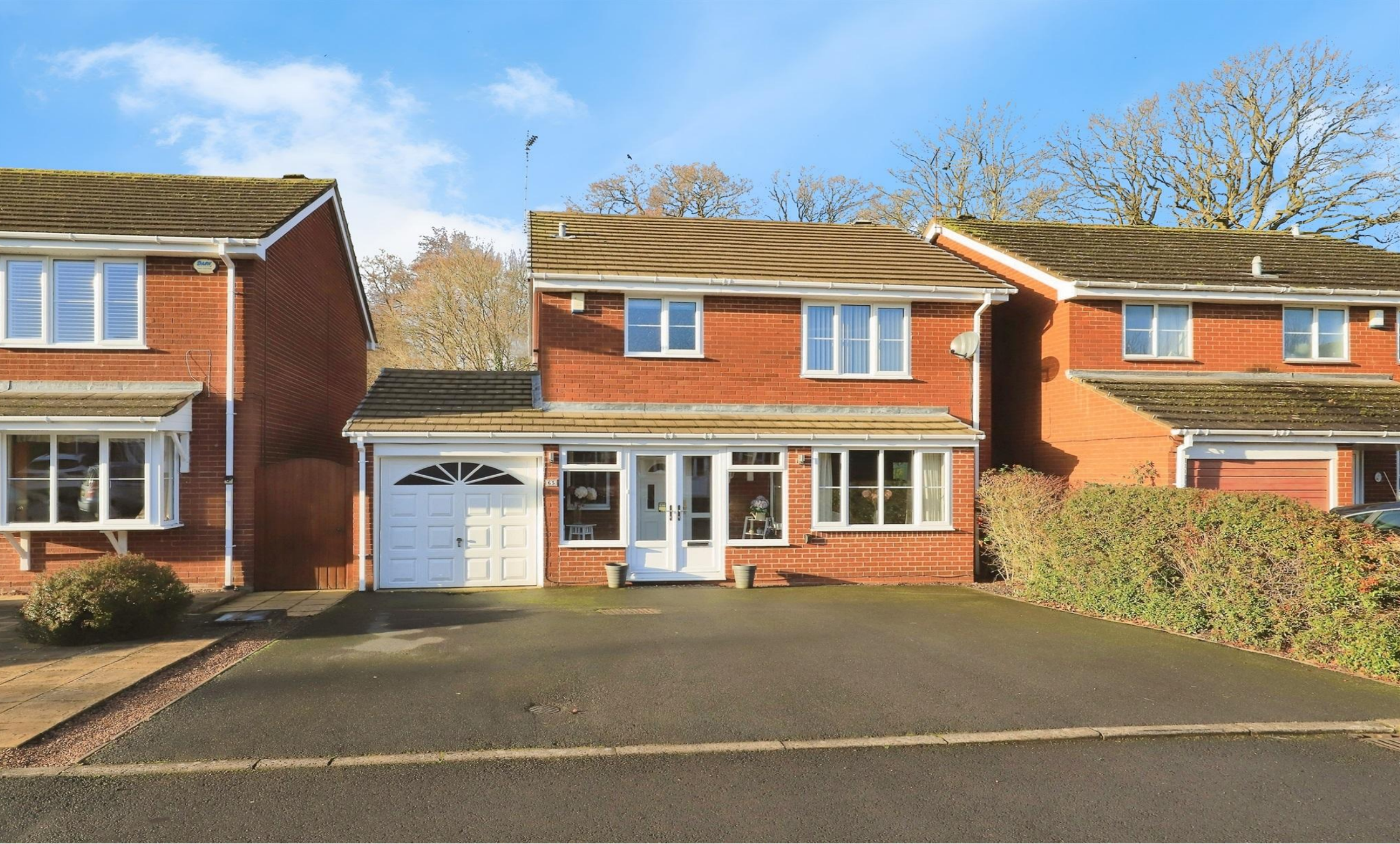
Jay Park Crescent, Kidderminster DY10 4JP