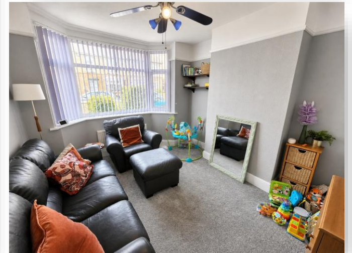
Dorrien Road, Gosport, PO12 4RA