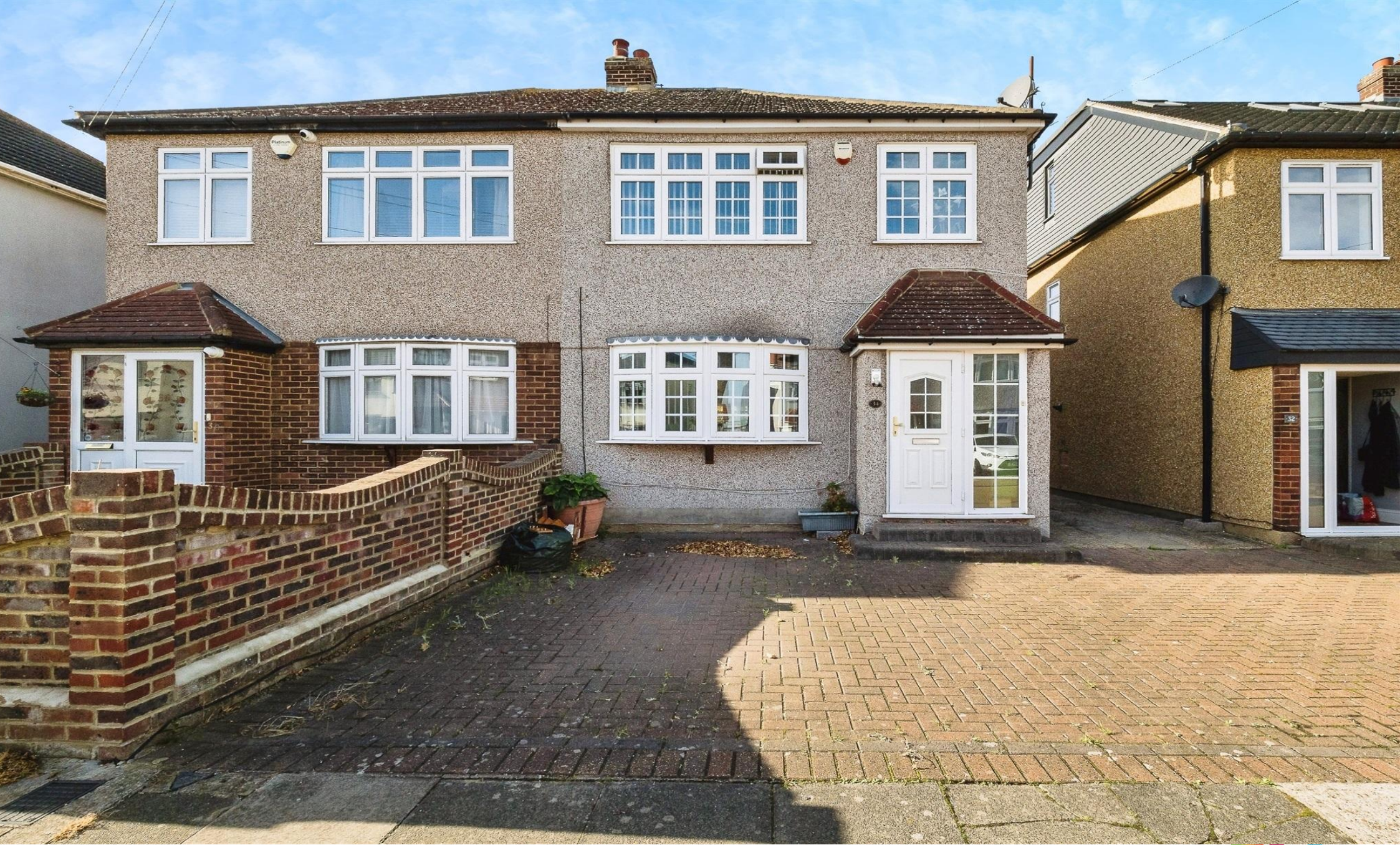
Lakeside, Rainham RM13 9SW