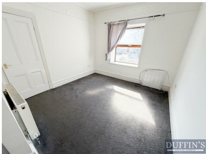
Reception Room One 10'10" x 10'11" (3.32m x 3.33m)