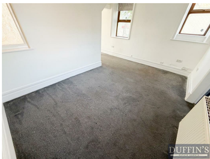
Reception Room Two 9'9" x 14'8" (2.98m x 4.49m)