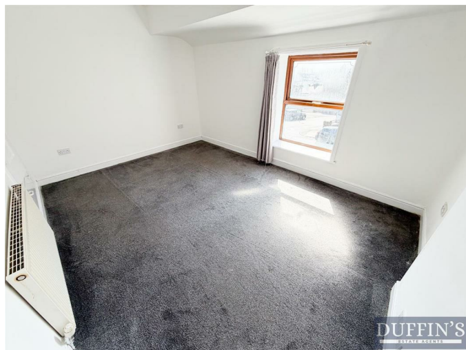
Master Bedroom 11'3" x 14'11" (3.44m x 4.57m)