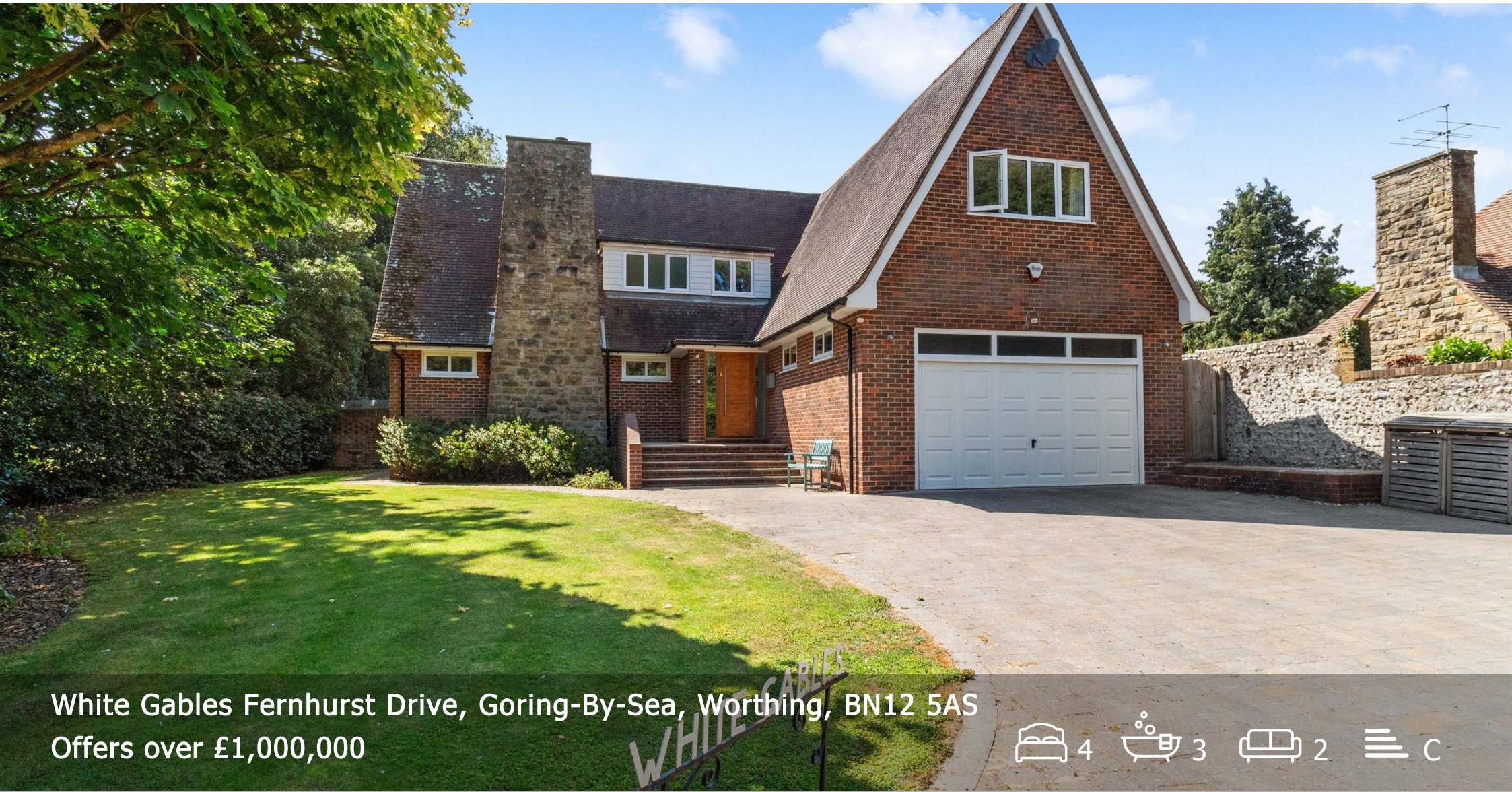
White Gables Fernhurst Drive, Goring-By-Sea, Worthing, BN12 5AS Offers over £1,000,000