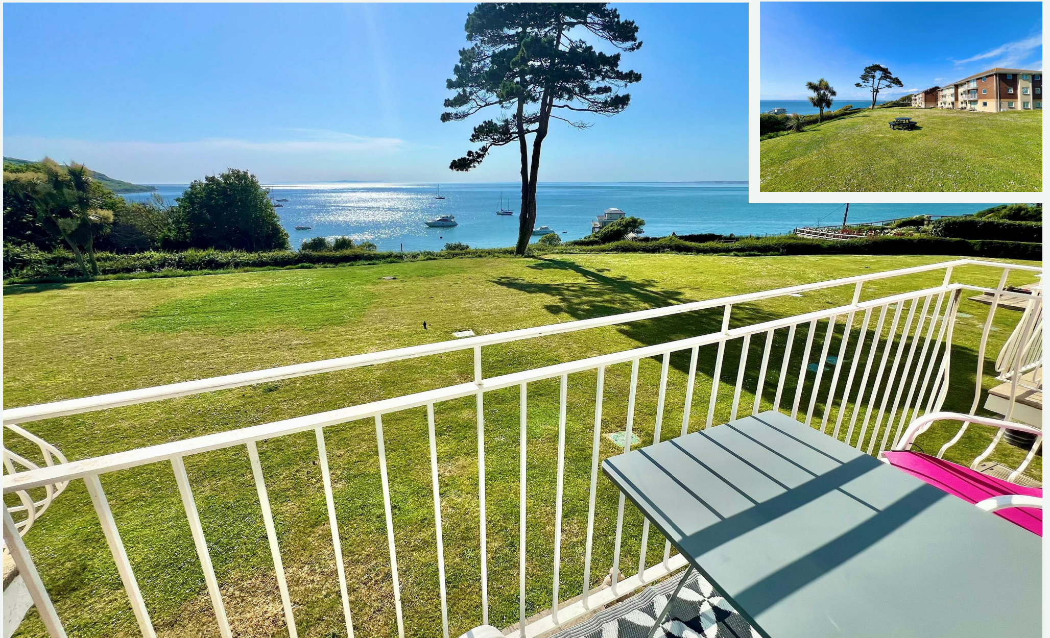
4 Aman Court, Granville Road, Totland Bay, Isle of Wight