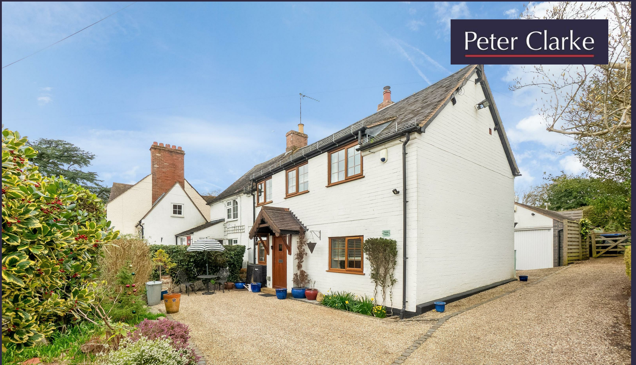
Field View Ashorne, Warwick, CV35 9DR