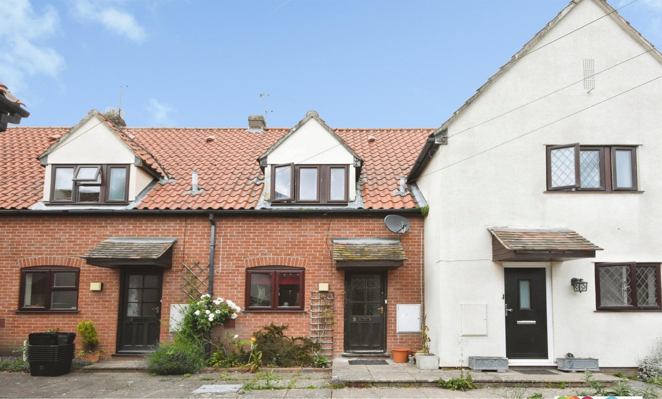
Old Mill Chase, Wethersfield, Braintree, CM7 4EB