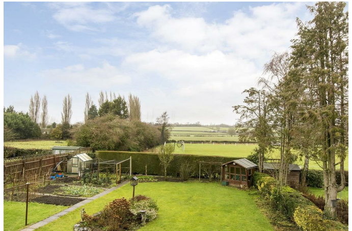
Garden (Photo Two)

The delightful mature garden is a rare find with far reaching rural view and privacy. Mainly laid to lawn with well stocked shrub borders and a vegetable plot compete with greenhouse and timber shed. The extensive patio is the perfect space to enjoy relaxing and entertaining in the summer months.