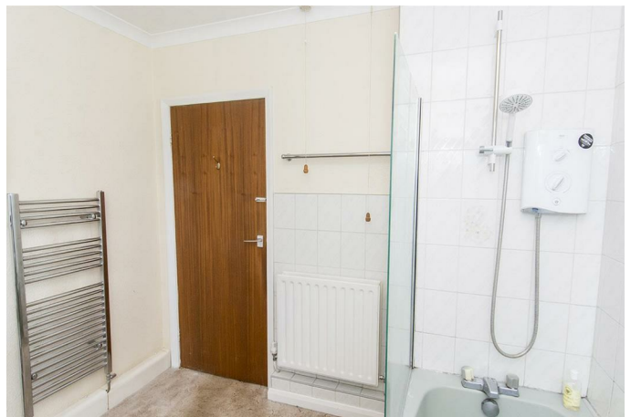
Bathroom ( Photo Two )

The ground floor bathroom is fitted with a low level WC. Pedestal wash hand basin. Bath with a Mira electric shower and side screen. Chrome heated towel rail. Ceramic wall tiles and dual opaque windows to the rear aspect.