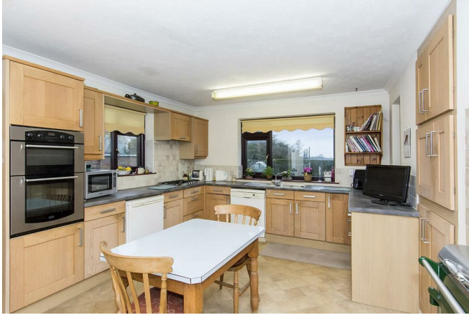
Breakfast Kitchen ( Photo Two )