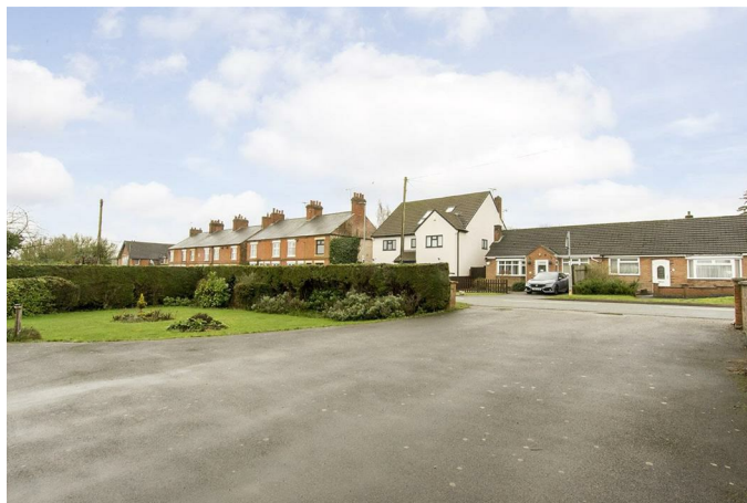
Outside and Parking

Set on a generous plot and framed by immaculate hedging, the garden is laid to lawn with well stocked shrub beds and the tarmacadam drive provides excellent parking for numerous vehicles.