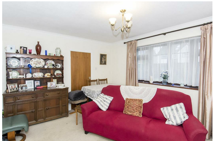
Snug/Dining Room (Photo Two)

This flexible room is open plan to the breakfast kitchen and has a bow window to the front aspect and a door opening into the hallway. There is a wall mounted electric air conditioning/ heating unit. .