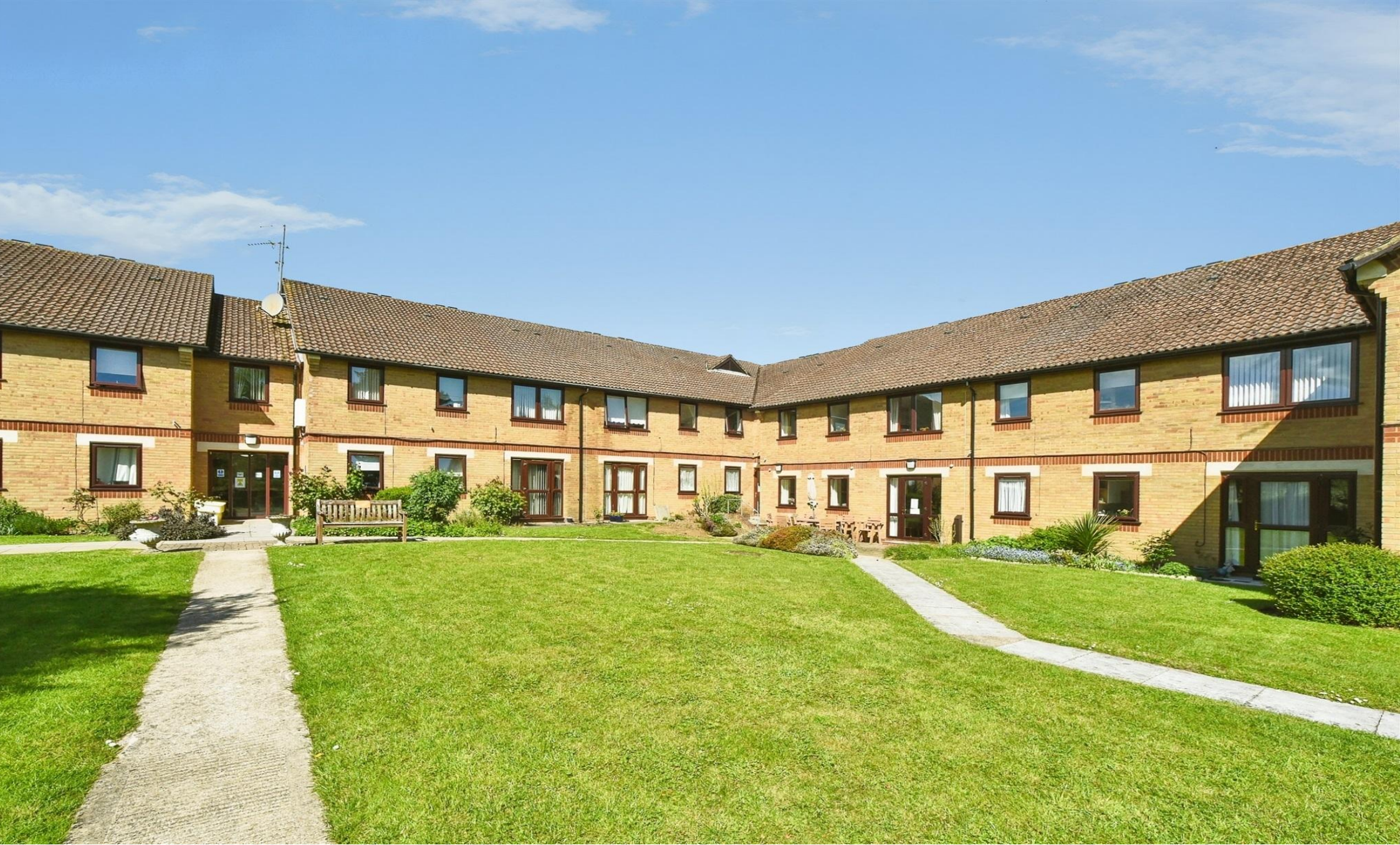
Ivyfield Court, Charter Road, Chippenham SN15 2QR