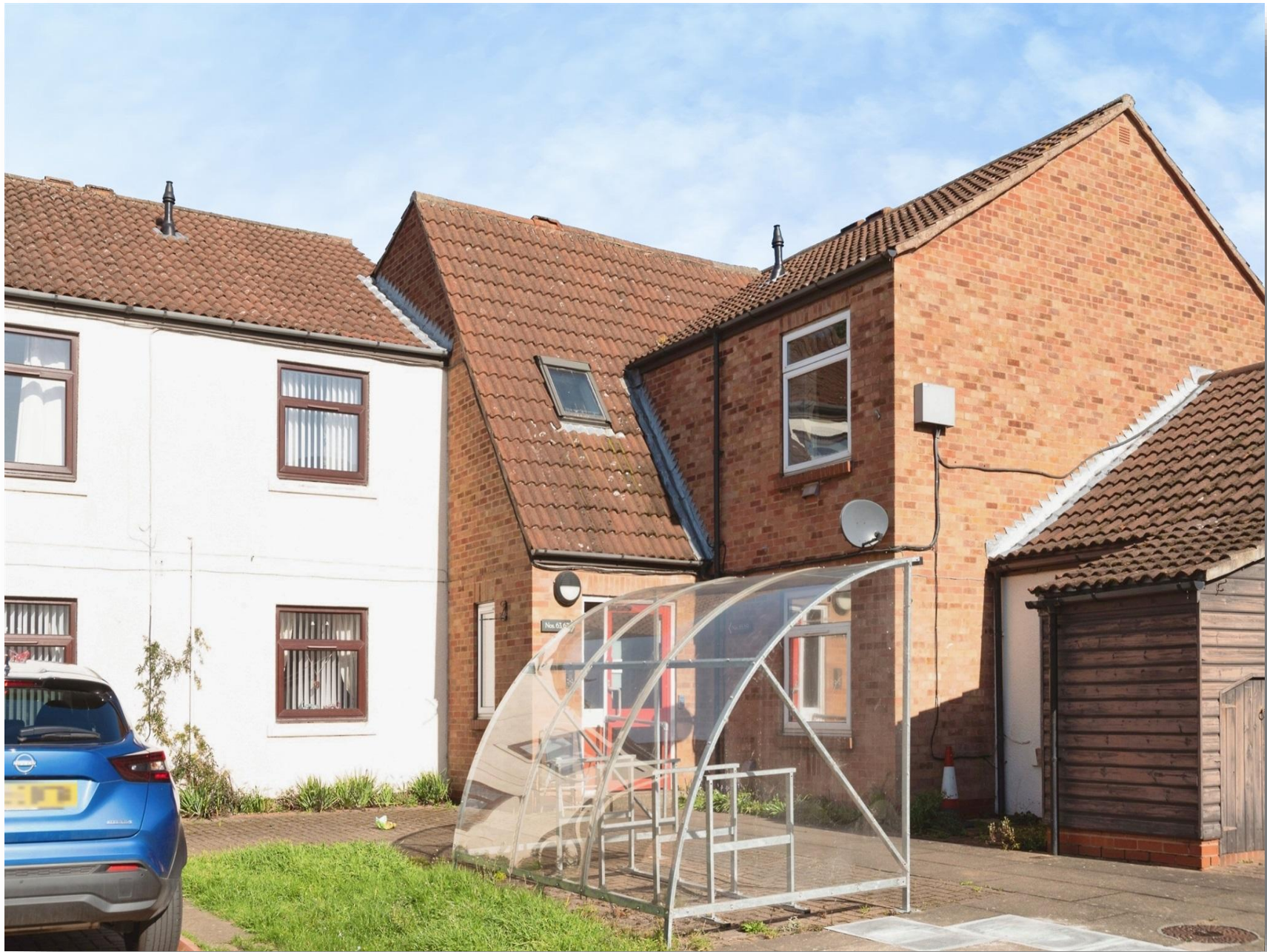
Watts Road, BEVERLEY, HU17 9DZ